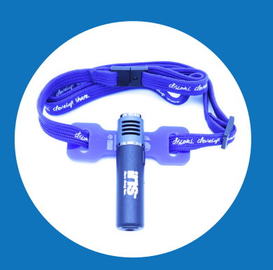
1 x Blue microphone and lanyard