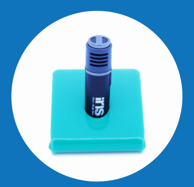
1 x Green microphone and holder