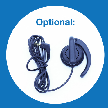
1 x Coaching ear piece Used only with the Go Live feature