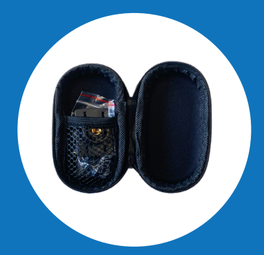
2 x Cases with spare parts for tripod