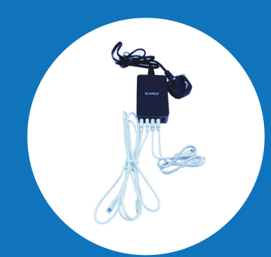
1 x USB charging hub and charging cables