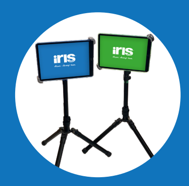
1 x Blue tablet with tripod 1 x Green tablet with tripod Poth with volces strengthed