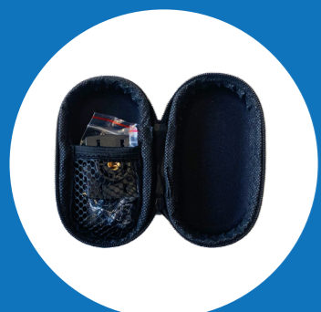
2 x Cases with spare parts for tripod