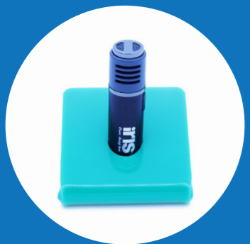
1 x Green microphone and holder