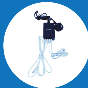
1 x USB charging hub and charging cables