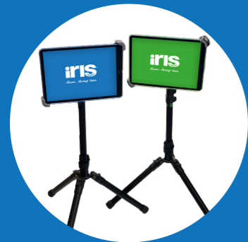
1 x Blue tablet with tripod 1 x Green tablet with tripod Both with velcro strap attached