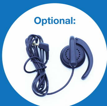
Optional: 1 x Coaching ear piece Used only with the Go Live feature