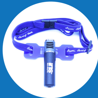
1 x Blue microphone and lanyard