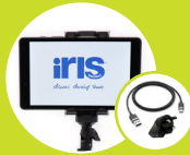
Tablet and charging cable