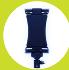
Tripod and device holder