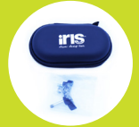
Microphone case and spare tripod screws