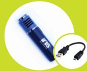
Microphone and charging cable