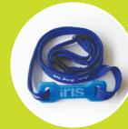
Microphone holder and lanyard