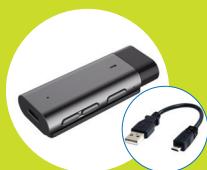
Bluetooth microphone and charging cable