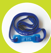
Microphone holder and lanyard