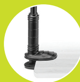
Adjustable table/shelf stand

(Go Live feature requires additional purchase)