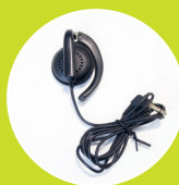
Earpiece for pairing Bluetooth microphone and Go Live feature