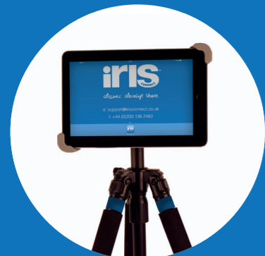
1x Primary iPad & tripod