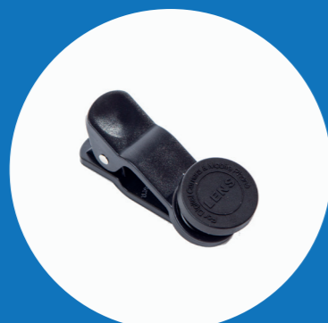
1x Wide angle lens