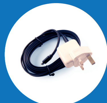
2x 3 meter iPad charging cables & plugs