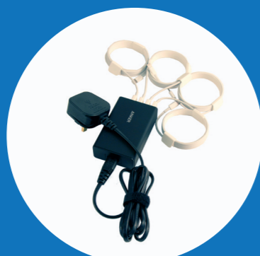
1x USB charging hub & charging cables