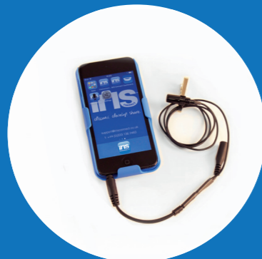
1x Primary iPod & lapel microphone