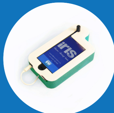
1x Secondary iPod & microphone Available only with Discovery Kit Pro